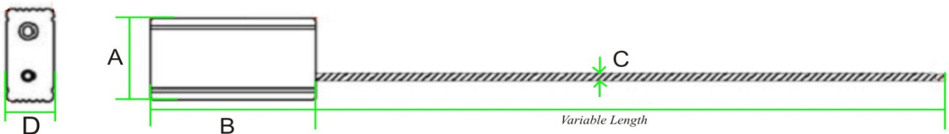
Line Drawing for K-Flex Lite